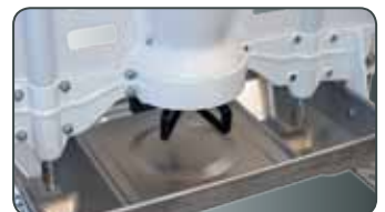
Version 3: Maximat - Wean-to-Finish 7-130kg