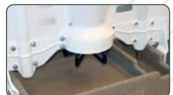
Version 4: Maximat Weaner Poly