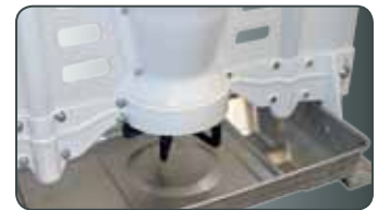
Version 2: Maximat Weaner 5-60 kg